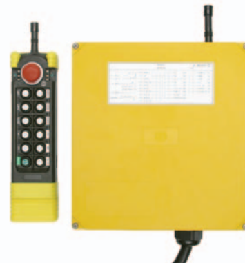
RC-IM-D2 Series 1220

Three Motion - Two Speed Key On/Off and E-Stop Two Auxiliary Switches which can be Programmed for Momentary or Maintained Two Transmitters with Batteries One Receiver Pre-Wired with 6' Pigtail