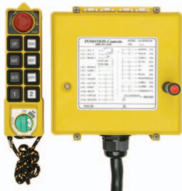
RC-IM-2 Series 322

Three Motion - Two Speed Key On/Off and E-Stop Two Auxiliary Switches which can be Programmed for Momentary or Maintained Two Transmitters with Batteries One Receiver Pre-Wired with 6' Pigtail